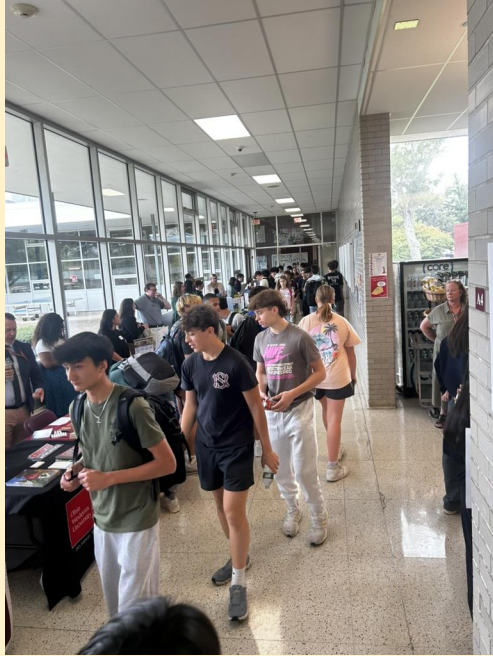
Mini College Fair