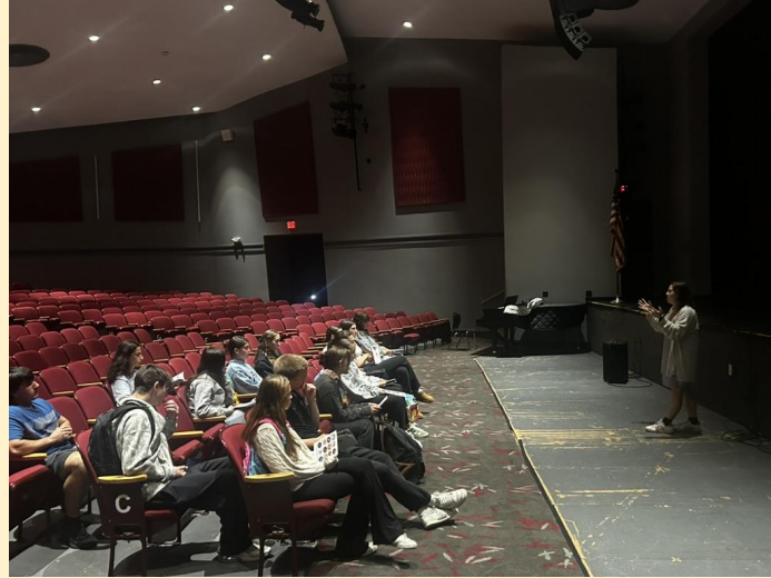
University of Florida