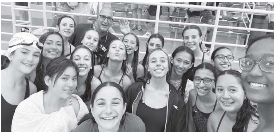
The Womens’s Swim Team Is Out To Excel

While swimming is not an easy sport to become adept in and excel at, anyone who joins the North Shore High School’s Team is guaranteed to end up finding a passion in the sport. The swimmers on the team are always pushing towards improvement, and nothing beats seeing their hard work and determination help them earn personal records during a meet. While fast times are important, the team also emphasizes having fun. At the end of the day, everyone on the team is just proud of the work she or he puts into making the group better overall.