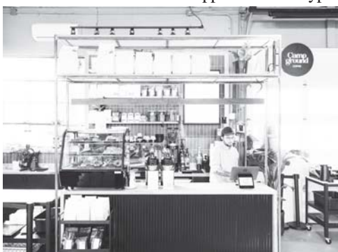
Campground Coffee Only Adds To The :Positive Vibes Of Sea Cliff

Locals should certainly look to Campground Coffee for any of their socializing, or caffeinating needs as it welcomes in “a bigger audience” for some unique sips and tastes. As it’s located in the center of the buzzing town of Sea Cliff, Campground offers a creative approach to the typical coffee shop.