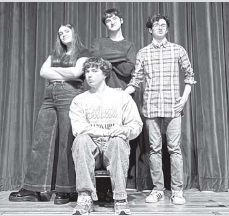
The Writers Of This Year’s Senior Play: Challenge Day: The Memories They Carried.

The Senior Play is an iconic North Shore tradition that unifies the Senior Class during its last few months at North Shore, by bringing together all different kinds of students in a collective effort. Rehearsals are timed during an exciting transitional period for these seniors, in which they are receiving college decisions, and studying for their last North Shore midterms; they must look to their unknown futures whilst also trying to keep their heads in the familiar cinderblock walls of the High School. This show was only the first of many upcoming events for the Senior Class such as Sports Night, the Senior Fashion Show, College Decision Day, Senior Prom, the Moving Up Day Ceremony, and Graduation; the school year is quickly progressing and the Senior Class is getting ready to wave goodbye. But, not before so many memories are made.