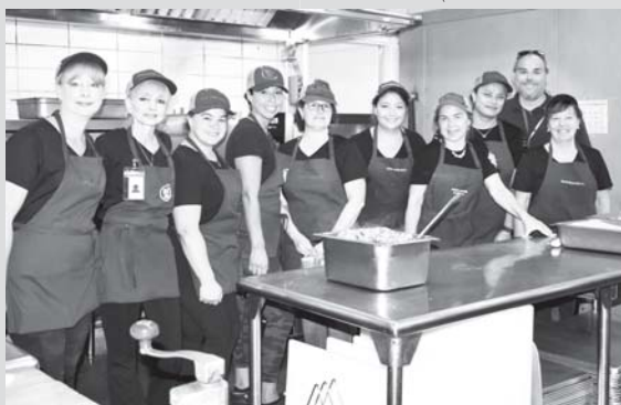
North Shore High School's Outstanding Cafeteria Staff